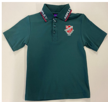
Prep Polo Shirt