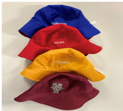
Reversible Bucket Hat with Sports House Colour