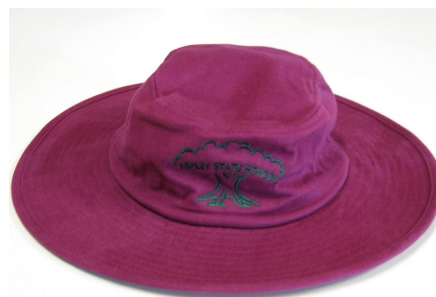
Wide Brimmed Hat